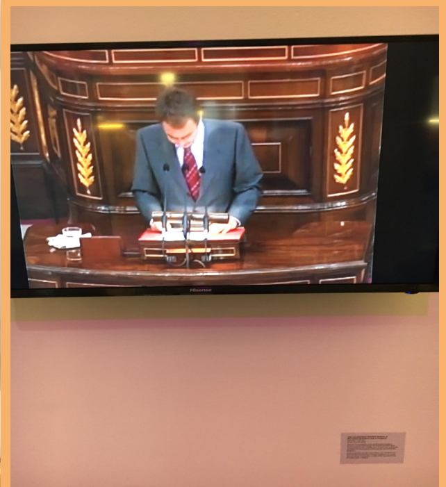
The passing of a gay marriage law in the Spanish parliament in 2005.