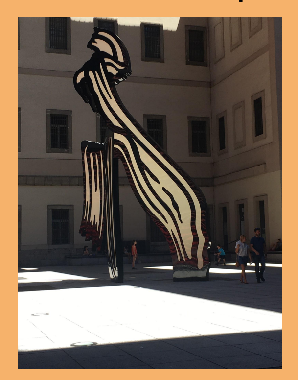
Statue outside of Regina Sophia Museum