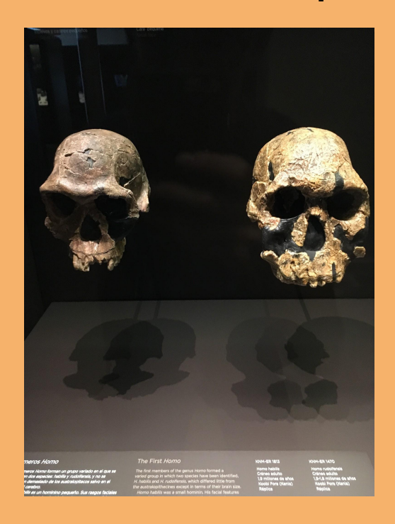
Homo Habilis and Homo rudolfensis