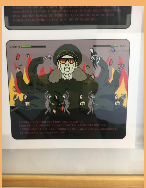
Artistic expression about the Franco regime